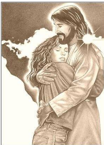
A HUG FROM THE LORD